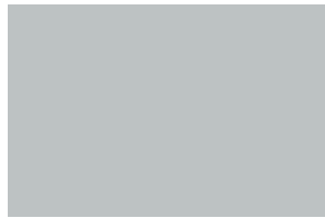
100 LIGHT GRAY

KEY RESIN EPOXY and URETHANE resins are high quality materials used as the building blocks for Key Resin's superior performing flooring systems. These chemically resistant systems offer outstanding impact and abrasion resistance with varying degrees of texture in a range of standard and custom solid colors.