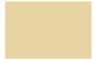
410 PALE BUFF