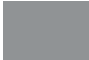
150 DARK GRAY