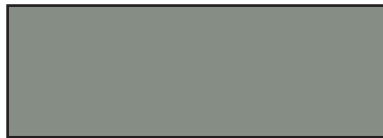
TRAFFIC GRAY A